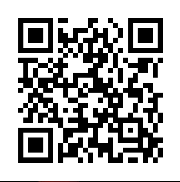
Tickets must only be purchased or sold within Alberta. See "Rules" at the above link for additional details.